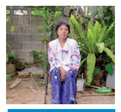
Before TB treatment