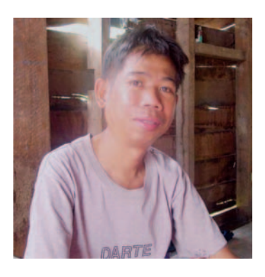
After TB treatment