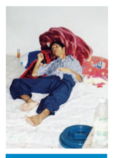
Before TB treatment