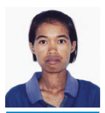
Before TB treatment