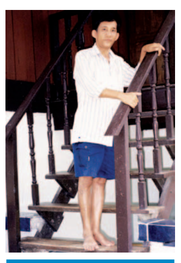
After 3 months of TB treatment