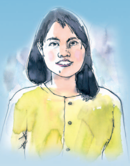
*Read the true stories of these patients in the section "Hope and Strength for Curing TB" *

Scientists around the world have been spending their endless efforts to help people who are suffering from AIDS. The outcome is quite encouraging. Currently, people with AIDS can expect to live with the HIV virus with a better prospect.